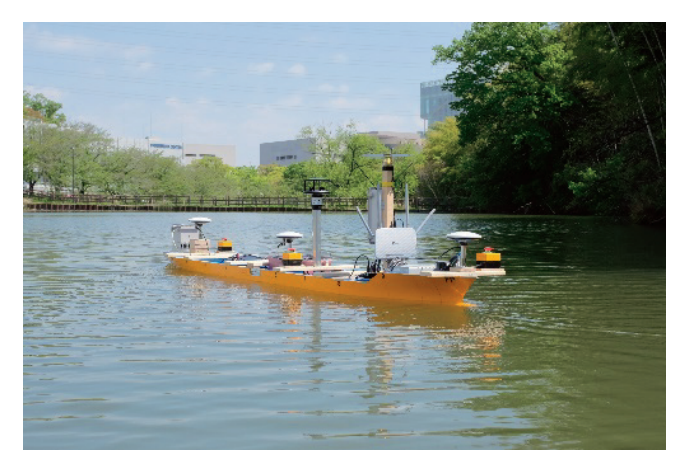
Fig. 2 Model ship at experimental pond of Osaka university

Fig. 1 Numerical result of automatic berthing/docking